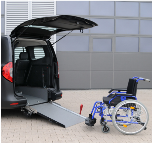
With the unfolded ramp the vehicle can be accessed comfortably with a wheelchair.

Nissan Townstar L1 (vehicle length: 4.5 m)