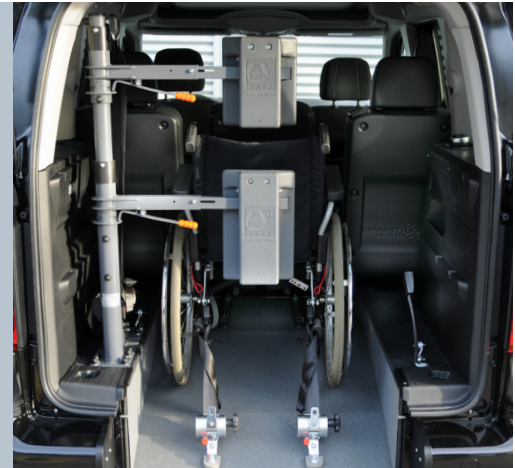
Optional the vehicle can be equipped with the head & backrest FUTURESAFE .