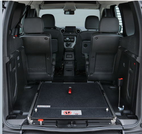
Optional EASYFLEX ramp folded flat allows full use of the luggage area.